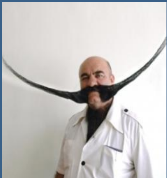
Winner - Moustache Comp 2007