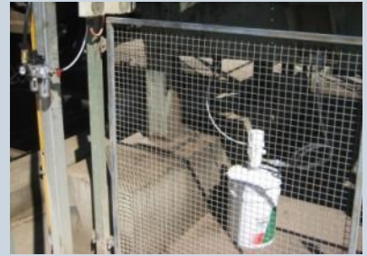
Simple - 20kg bucket with air on off ball valve.