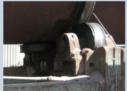
Stainless tube on tyre