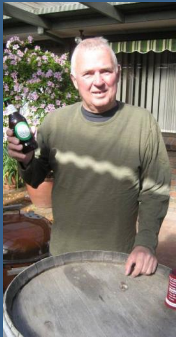
Wolfy – in between his public transport (ambulance) visits to the hospital.