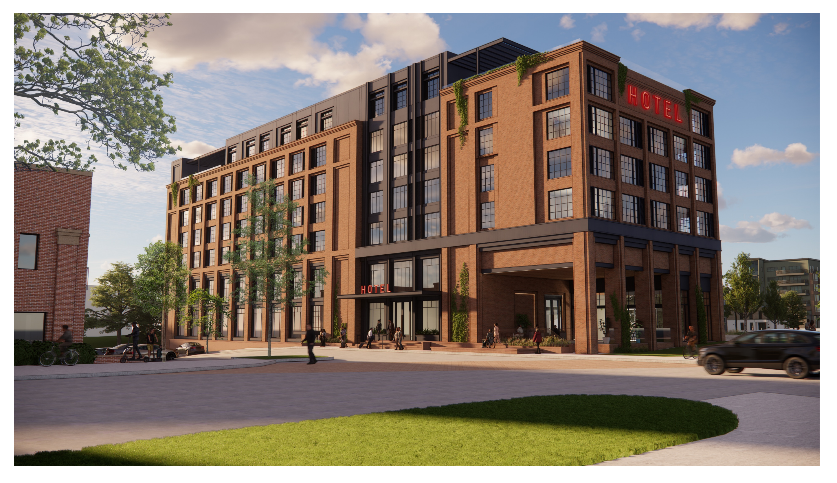
South Façade – Image looking northeast at the hotel main entry