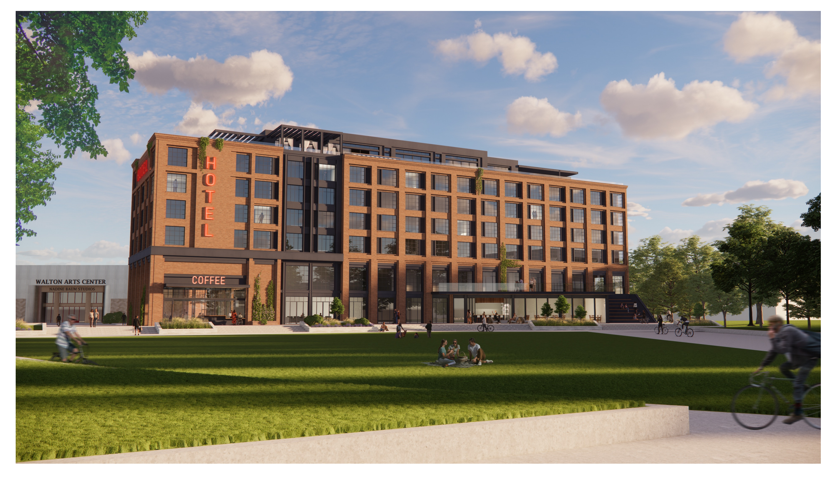
North Façade – Image looking south across the Ramble Park