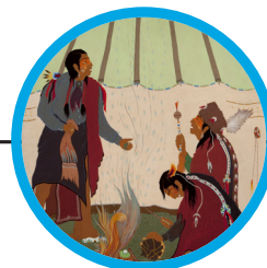
Dream Lab / Wanda Aragon, Polychrome jar , c. 1986 / Woodrow Wilson Crumbo, Burning of the Cedar , 1947