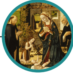
Frida Kahlo, Self-Portrait with Monkeys , 1943 / Kehinde Wiley, Equestrian Portrait of Philip IV , 2017 / Biagio d'Antonio, The Adoration of the Child with Saints and Donors , c. 1476