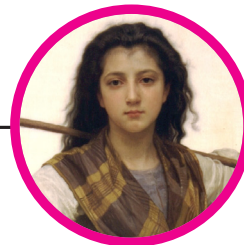
Unknown Egyptian artist, Mummiform coffin , c. 300 BCE / Alexandre Hogue, Erosion No. 2 - Mother Earth Laid Bare , 1936 / William-Adolphe Bouguereau, The Little Shepherdess , 1889