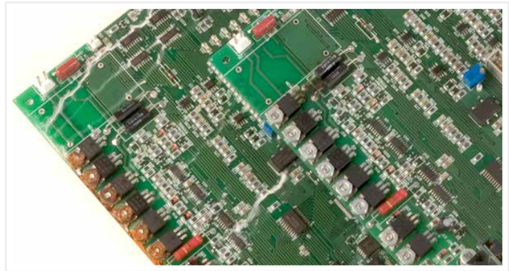
Parylene-coated (top) and uncoated (bottom) boards after testing in salt-fog environment. The coated board shows no signs of corrosion.

To achieve the highest level of protection from a conformal coating, adhesion of a coating to its substrate is critical. As new materials have been developed and are being utilized in today’s consumer electronics,