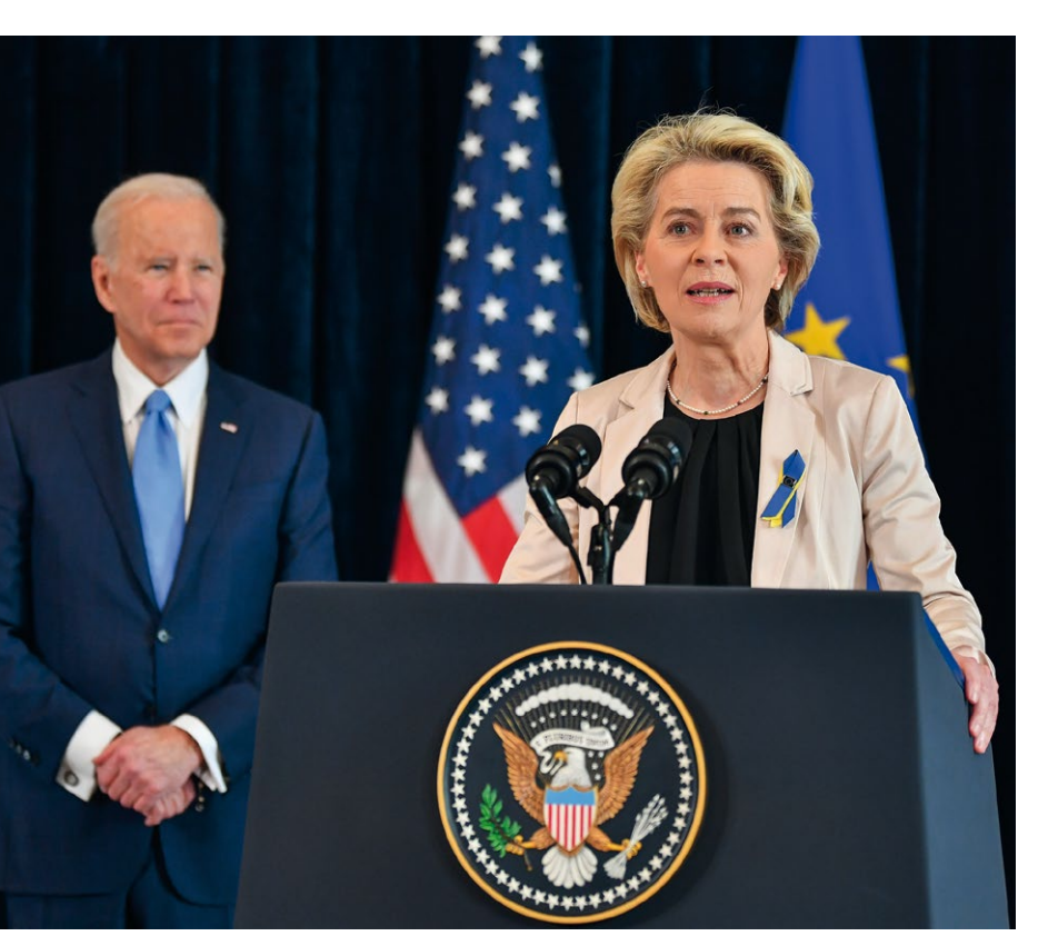
European Commission President Ursula von der Leyen and US President Joe Biden hold a joint press conference in Brussels, March 2022.

Global Economy and Finance, and Global Health programmes, is leading a high-level initiative on the global recovery. The project recognizes that public leadership and strong global partnerships are essential, but that private capital must be mobilized to meet the scale of the need for a sustainable global recovery. The first paper from the project, The role of the G7 in mobilizing for a global recovery , explored key policy priorities for the G7 nations and the EU.