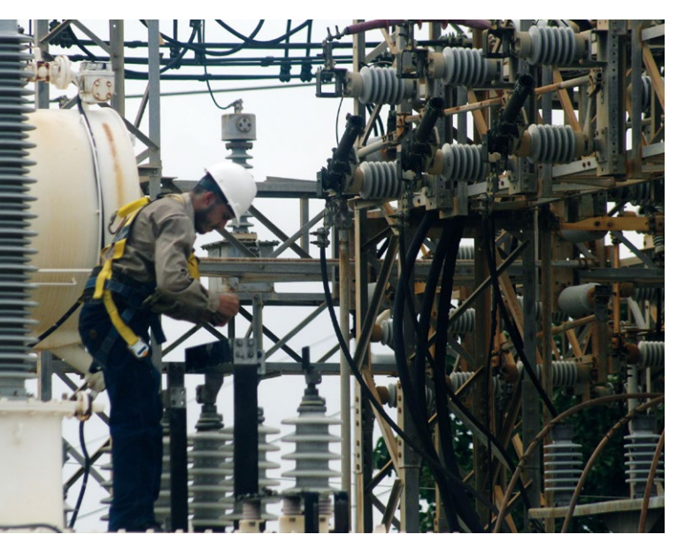
Workers reconnect the power in Maracaibo, Venezuela, in June 2019: three years on, electricity shortages remain critical.

High prices for food and energy pose immediate threats to human security, particularly among low-income and vulnerable populations. As global markets reeled from the impacts of Russia's invasion of Ukraine, our April 2022 event and research paper examining The Ukraine war and threats to food and energy security provided early analysis and recommendations on how to tackle the challenges ahead. The paper fed into a high-level global meeting of philanthropists, and highlighted a series of 'no-regrets' policy options that could mitigate the impact of the war on food and energy markets.