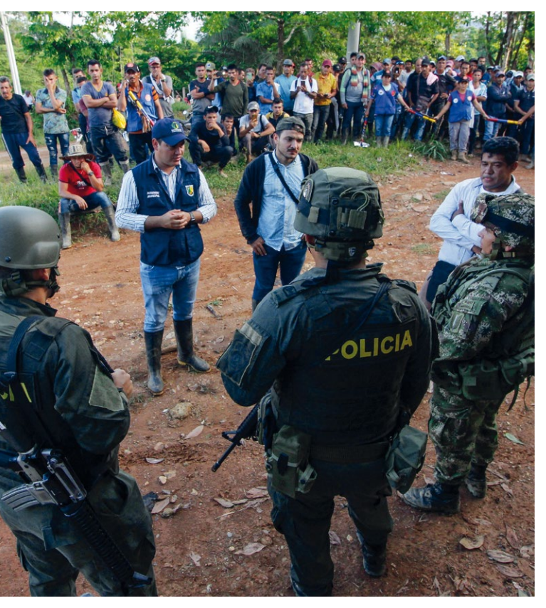
Coca growers and civilians prevent soldiers from destroying illicit cocaine plantations in Tibú, Colombia, May 2022.