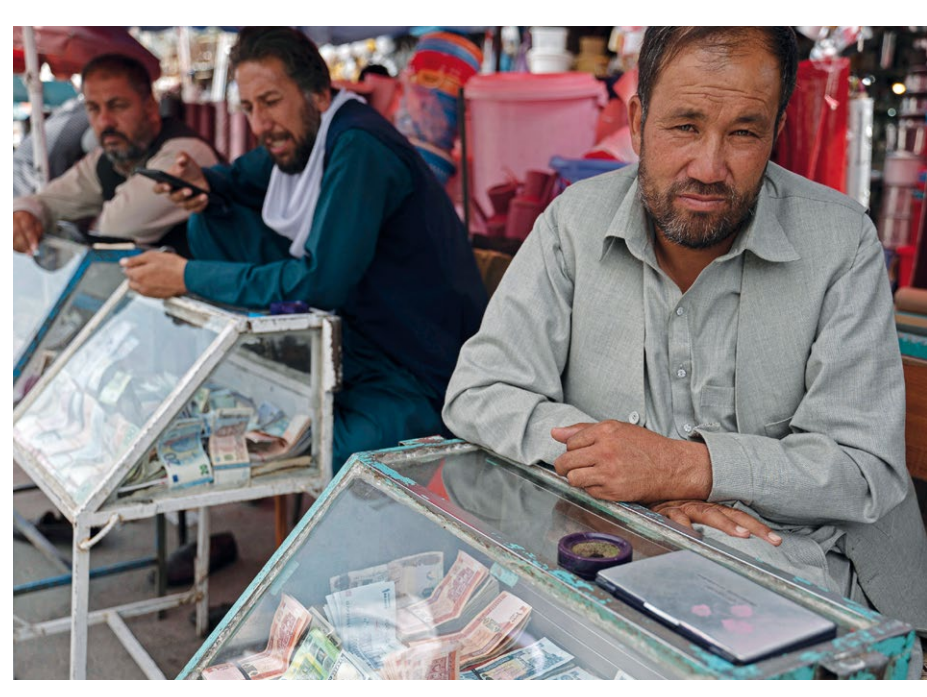
Afghan money changers wait for customers along a street near the Sarai Shahzada currency exchange market in Kabul on 15 May 2022.

The Taliban takeover of Afghanistan in 2021 triggered economic collapse. Chatham House partnered with other leading think-tanks to discuss policy approaches in the wake of the crisis. Focusing on development and humanitarian aid, the Afghanistan Strategic Learning Initiative engaged more than 150 participants in workshops to develop evidence-based policy options. The project was led by the UK Humanitarian Innovation Hub.