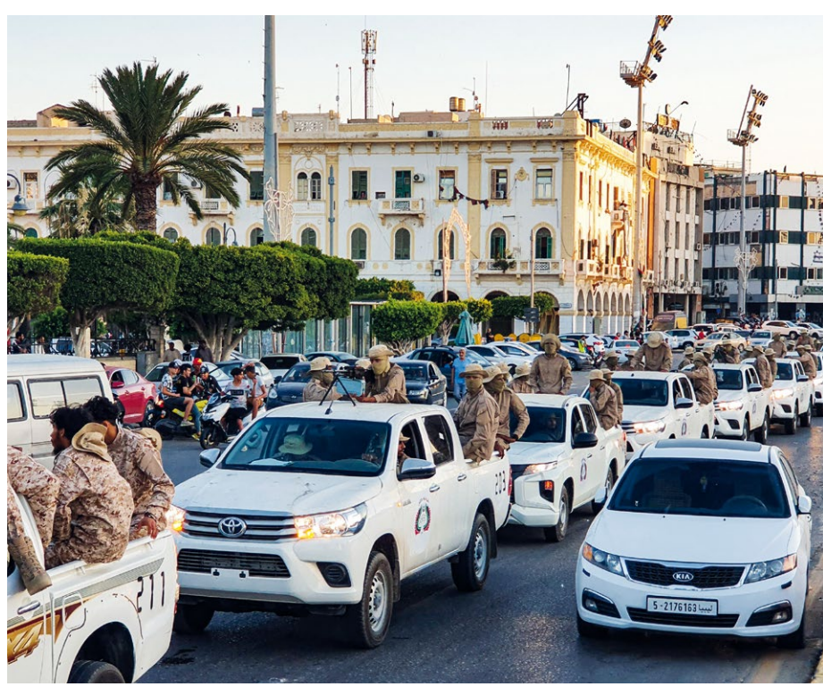
The 'Tripoli Brigade', a militia loyal to the Government of National Accord, parades through the centre of Tripoli, Libya, in July 2020.

Increasingly, the line between state actors and non-state armed groups has become blurred. Many have one foot in the state and one foot outside of it. Research by our Middle East and North Africa Programme on Libya, Iraq and Lebanon explores how policymakers should understand these hybrid armed actors and find means of engaging them.