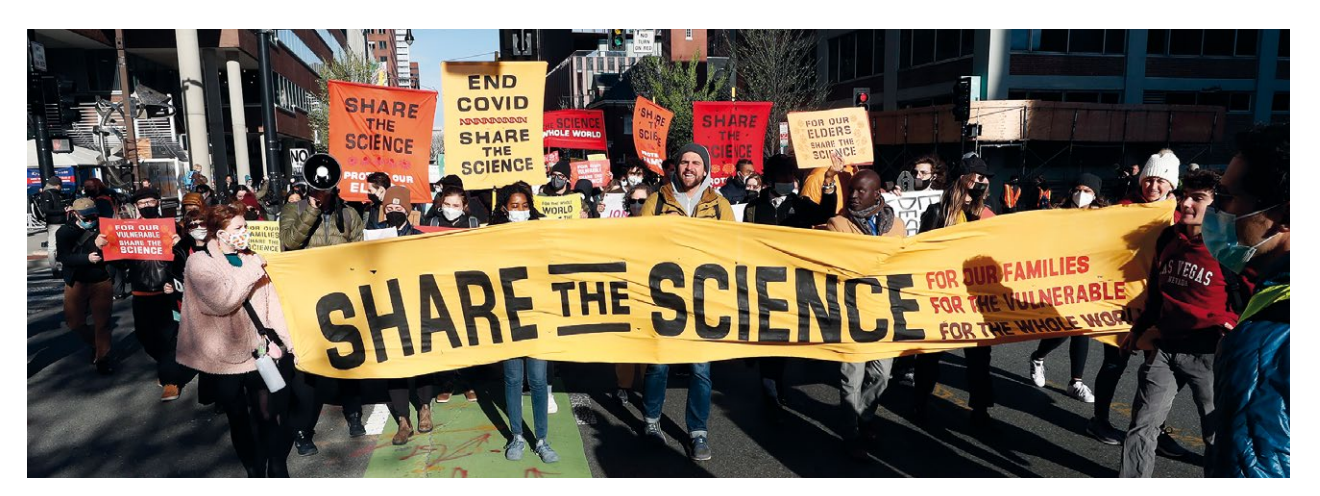
Demonstrators in Cambridge, Massachusetts, demand that pharmaceutical companies share COVID-19 vaccine science with other countries.

As the world started to emerge from the pandemic, Chatham House's health research focus turned towards applying lessons learned to future health challenges. This included contributing to the March 2022 Coalition for Epidemic Preparedness Innovations (CEPI) summit. Our Global Health Programme is currently examining past financing initiatives for global health public goods to inform future action. This work includes developing an assessment framework for understanding challenges to securing international political commitments to fund global health interventions that benefit everybody as public goods.