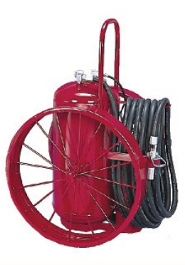
Model 630 33 gal. FFFP Foam