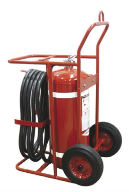
Models 673, 674, 675 65 lb. / 150 lb. Halotron™ I