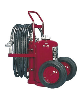
Models 450, 451, 452 125/150 lb. Dry Chemical