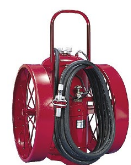
Models 491, 492, 493 300/350 lb. Dry Chemical