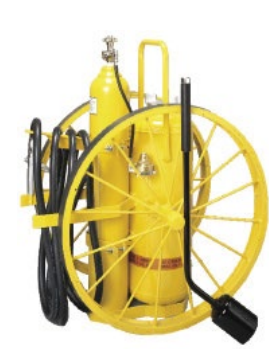
Model 680 150 lb. Sodium Chloride Model 681 250 lb. Copper