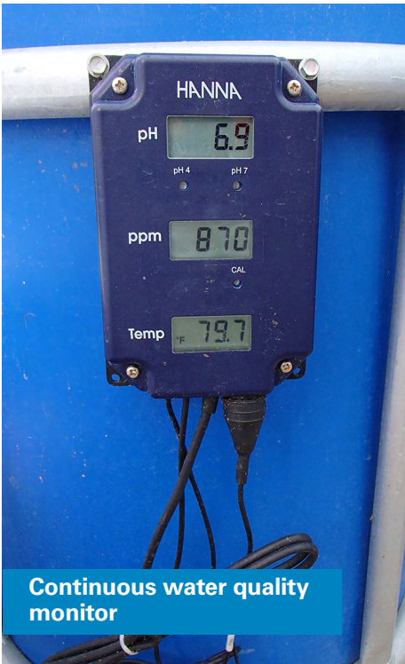
Continuous water quality monitor