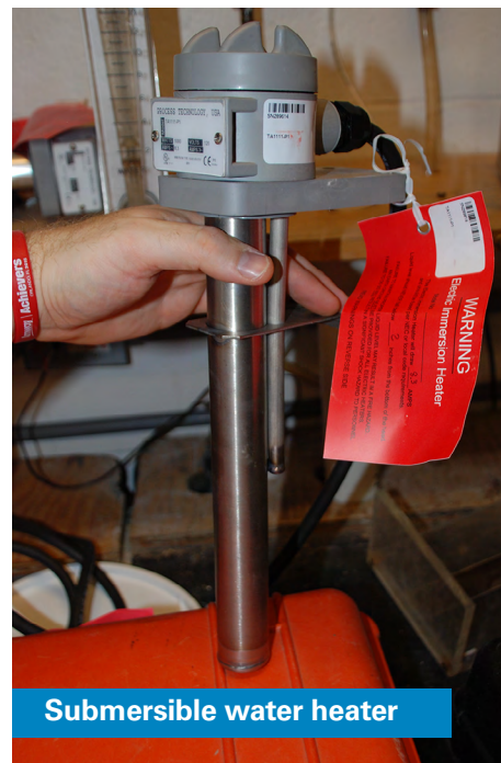
Submersible water heater

contained within the aquaculture system. No other physical factor affects the development and growth rates of fish as much as water temperature. Each species of fish has a temperature range it can tolerate. Within that range, there is an optimum temperature for growth and reproduction which may change as the fish grows. Many biological processes, such as spawning and egg hatching, are geared to natural annual changes in environmental temperature. Each 10°C temperature change has a two-fold effect on the metabolic rate of cold-blooded animals. For example, increasing water temperature 10°C will double the metabolic rate of an organism, which correlates to higher food consumption and growth rate as well as an increased biological oxygen demand (BOD). However, this relationship only holds true within the acceptable temperature range for any given species. Outside this temperature range, proteins and enzymes that perform essential metabolic processes of a given species begin to denature and break down such that they are no longer useful.