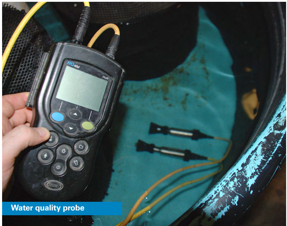
Water quality probe

Good water quality is the goal for any aquaculture operation. Among the parameters most critical to monitor on a frequent or even constant basis are temperature, dissolved oxygen, and pH. Each species of fish has different tolerance ranges for each parameter used to quantify water quality. Tilapia are amongst the most tolerant fish species, whereas trout are amongst the