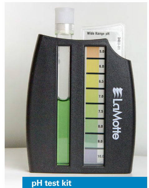
pH test kit