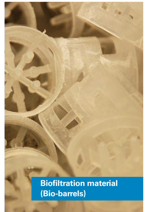
Biofiltration material (Bio-barrels)

In Iowa, the TMDL is regulated by watershed, and the specific effluent allowances for any aquaculture facility are subject to local regulations. IDNR ( www.iowadnr.gov/InsideDNR/RegulatoryWater.aspx ), the Coalition to Support Iowa Farmers ( www.supportfarmers.com/ ), or Iowa State University Extension ( www.extension.iastate.edu ) should be contacted for help with determining the regulations on an individual site basis.