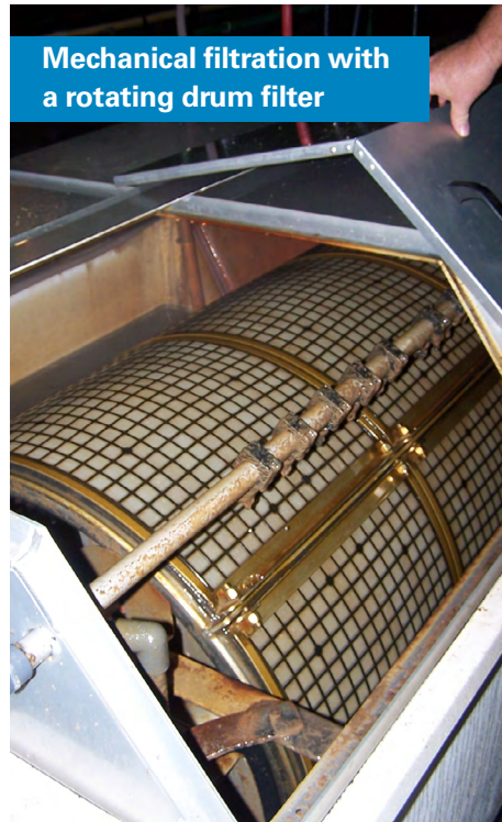
Mechanical filtration with a rotating drum filter