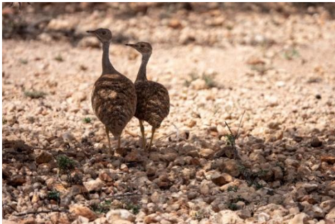
Little Brown Bustards