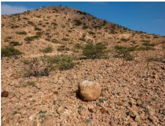
Hills of the beira

This is an area of rocky hills that are inhabited by beira. We did some hiking around some of the hills looking for beira and saw track and scat but did not have any luck seeing them on the first day.