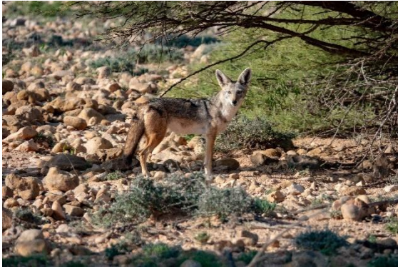
1 Golden wolf

We headed back to Hargeisa on the 13 th and on the way had a great view of a golden wolf.