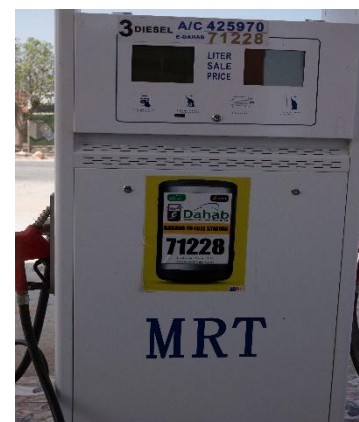
Electronic Price on Gas Pump

When Somaliland broke away from Somalia it formed what is today a multi-party democracy with a separate government and currency from Somalia. Unfortunately, the international community has not recognized Somaliland as a separate country and considers it to continue to be a part of Somalia. Therefore, the Somaliland currency is not accepted outside of the country. This has led to the development of an electronic currency whereby it is possible for residents to make payments and receive funds with their cell phones. There are no cash registers to be seen but electronic account numbers are used instead.