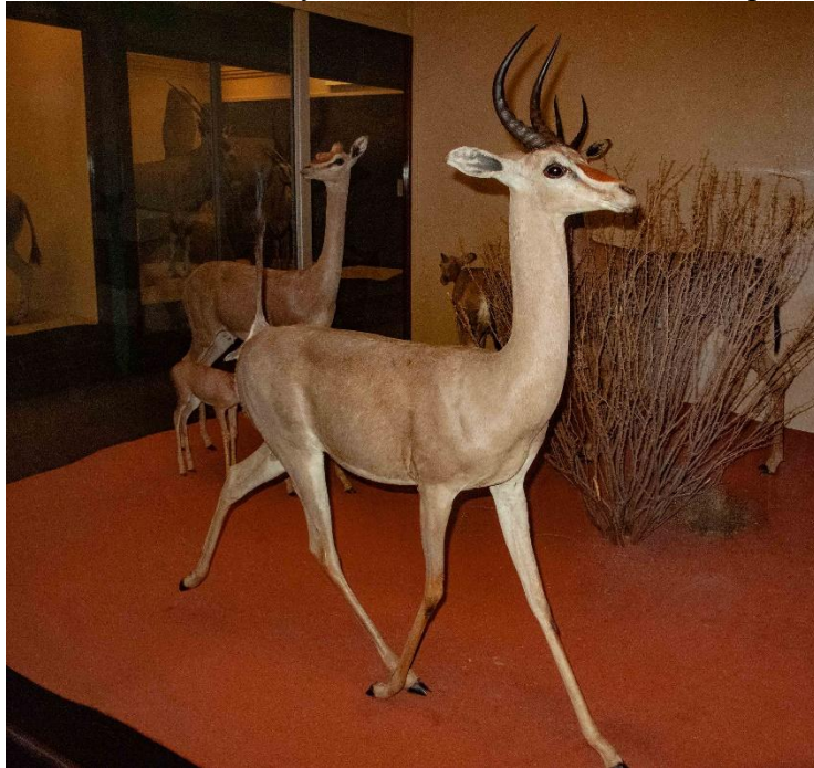
Dibatag exhibit at Field Museum of Natural History

As a lifelong mammalwatcher, my interest in antelopes of the Horn of Africa was launched when as a youth I saw a group of mounted dibatag at the Field Museum of Natural History in Chicago. Later I learned about the beira antelope breeding program that had existed at the Al Wabra Wildlife Preserve in Qatar. This added more fuel to my passion to see these animals in the wild. But it was not an easy matter to see these rare antelopes. The dibatag live in Somalia and the