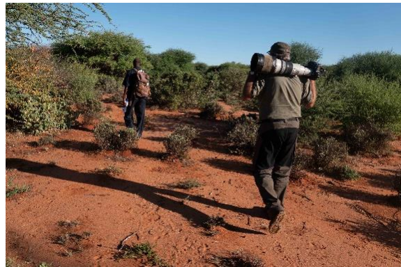
Searching for Dibatag

It was frustrating to not see one but seeing all the evidence of their activity and the environment in which they lived filled in many questions I had since seeing the museum mounts.