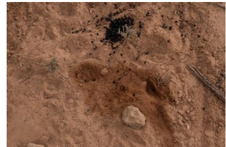
Beira markings and scat

This is an area of rocky hills that are inhabited by beira. We did some hiking around some of the hills looking for beira and saw track and scat but did not have any luck seeing them on the first day.