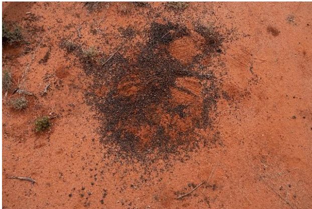
Dibatag scratchings and scat

We would go out early each morning and mid afternoon in search of dibatag. We saw many tracks and some scratching in the earth and two of our party got good views one afternoon but it was very challenging as they are quite shy. One afternoon Håkan went with me to make another attempt and he saw one but I could not see it as it quickly slipped away.