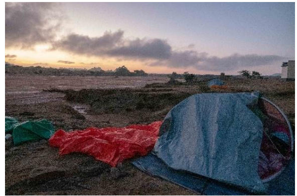
Camping by a Wadi