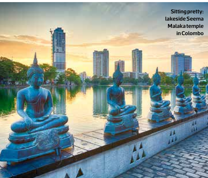
Sitting pretty: lakeside Seema Malaka temple in Colombo