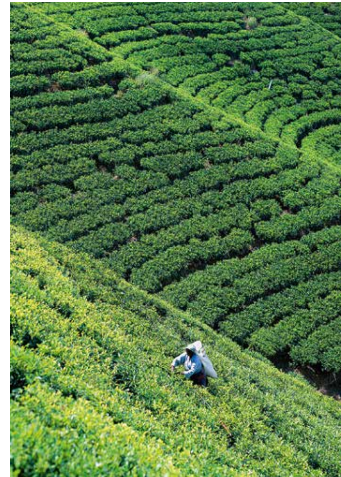
Sweetness and light: left, Kandy Lake. Right, traditional wadai fritters; terraced tea fields